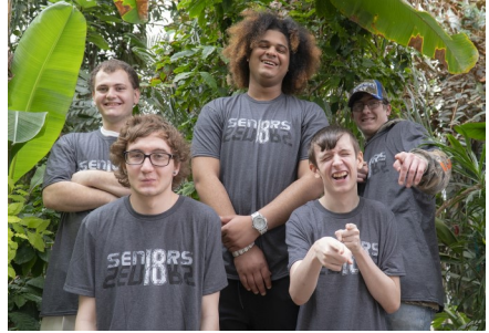
Phoenix Graduation - May 2018

The Bethany Black-Hawk Phoenix Day Treatment Program offers special education services, case management services, and interventions to area youth who are at risk of disrupting from their homes of origin and being placed in a residential setting. Treatment is based on each student's individualized educational plan (IEP). The Phoenix Day Treatment Program assists students between the ages of 11 and 22 who have demonstrated severe behavioral and emotional problems and who have been unsuccessful in their home school districts. The program is run by Bethany for Children & Families and the Black Hawk Area Special Education District (BHASSED).